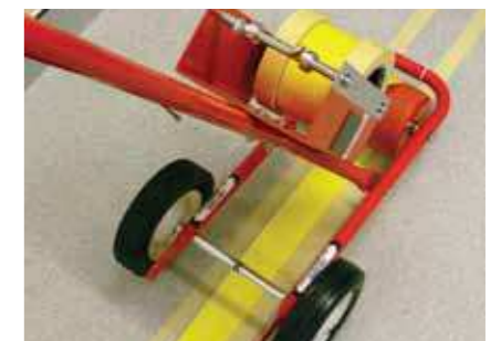
STEP 6: Tape application

A primer is applied to increase the adhesion of the vinyl tape to the surface.