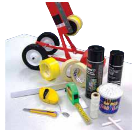
STEP 1: Tools required