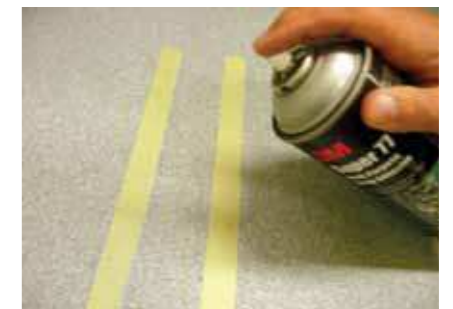
STEP 5: Priming

Masking tape is applied to ensure accurate primer application.