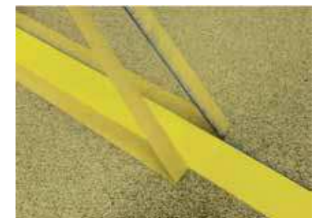
STEP 7: Finishing application

The tape is applied using 3M applicator between the two rows of masking tape.