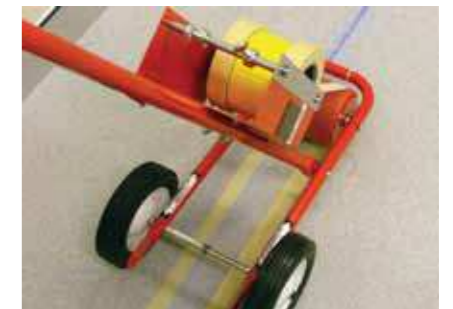
STEP 4: Masking application

Accurately measure and then mark the area to be taped with a coloured chalk line.