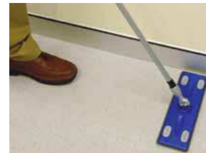
STEP 2: Preparation

Ensure the surface is clean and free of contaminants and debris.