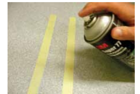
STEP 5: Priming

Masking tape is applied to ensure accurate primer application.