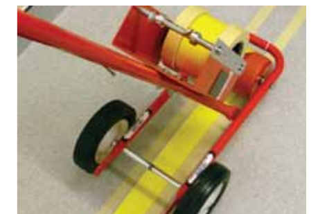
STEP 6: Tape application

A primer is applied to increase the adhesion of the vinyl tape to the surface.