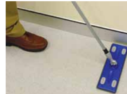
STEP 2: Preparation

Ensure the surface is clean and free of contaminants and debris.