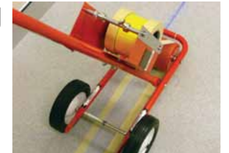
STEP 4: Masking application

Accurately measure and then mark the area to be taped with a coloured chalk line.